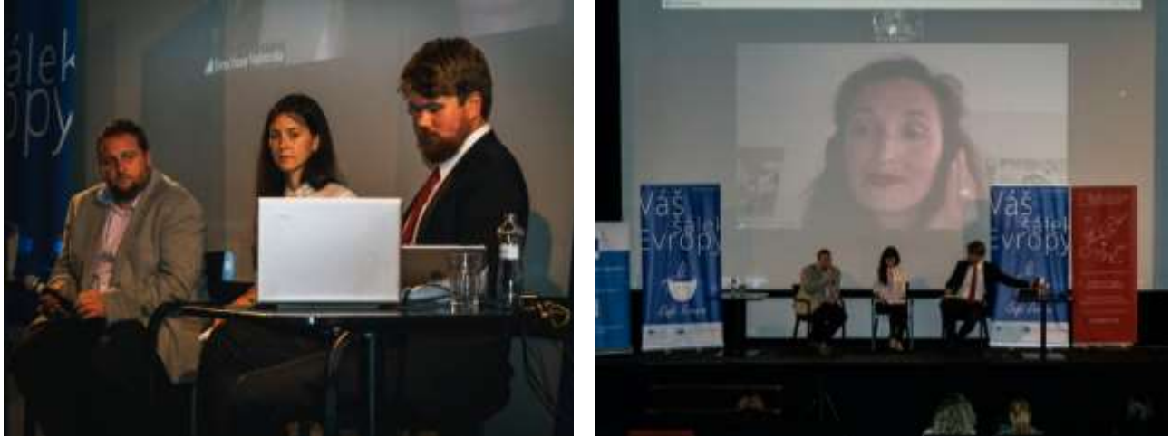
Café Europe debate about the issues of drought and wildfires after the screening of the film Fire Will Come.