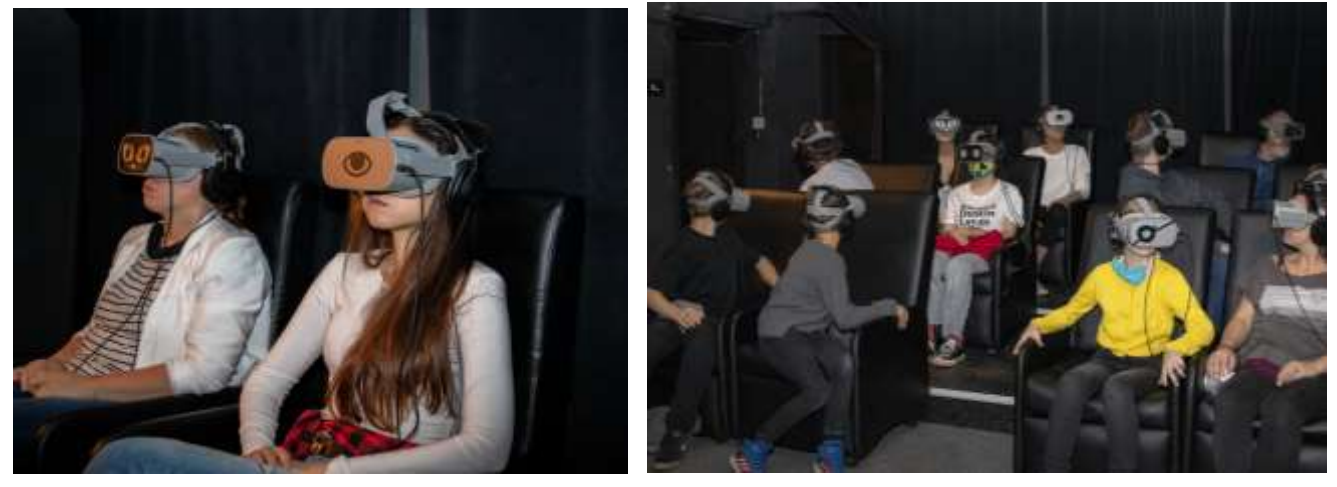
Audience watching VR films.