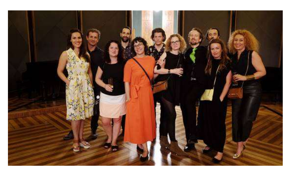
The team of Days of European Film in the Lord Mayor's Residence during the ceremonial opening.