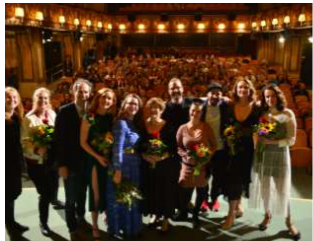
After the screening of the Czech film titled Snowing!